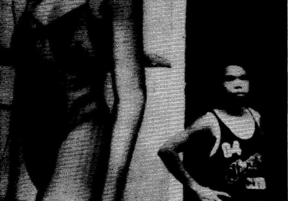
Thriller in Manila.