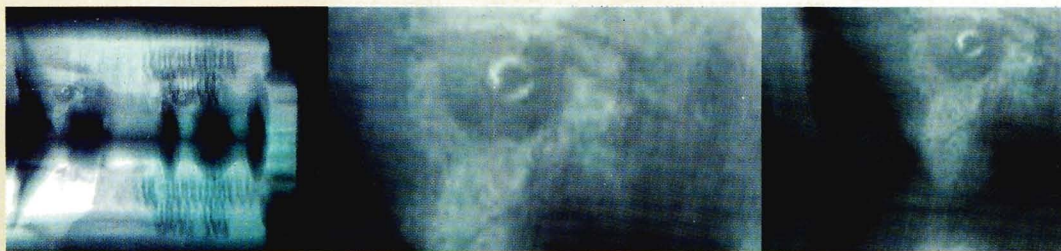
Emil Novak FLUTTER 1998 (detail)