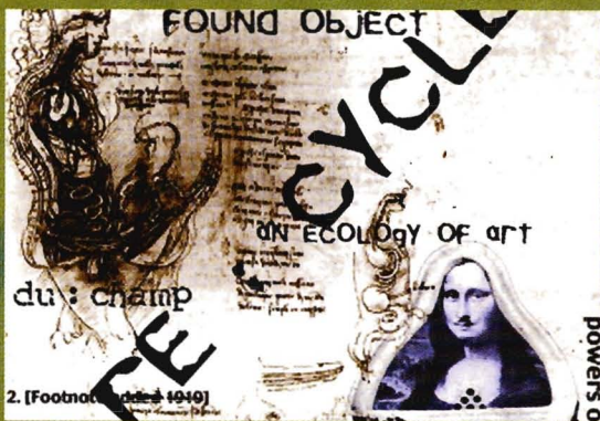
Stamp/Sharp/Couros BASILISK & A UNIVERSE OF DIRT 1999

concept, program brochure & video compilation editor alessio cavallaro