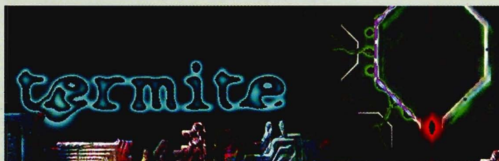
Gary Zebington TERMITE 1999 (detail)