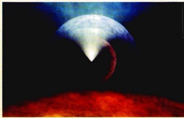
Ying Tan ELEMENTS IN TRANSFORMATION #2 1998